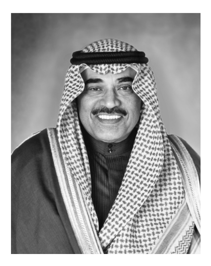
H.H. Sheikh Sabah Al Khaled Al Hamad Al Sabah Prime minister of the state of Kuwait